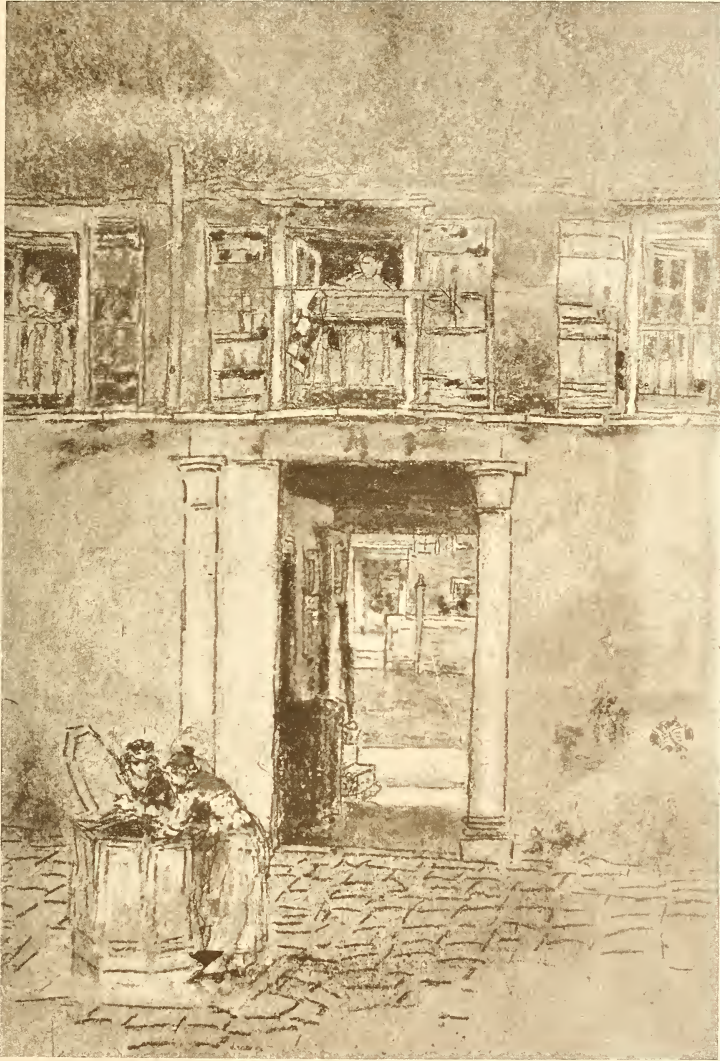
THE DOORWAY—VENICE. (Pastel.)